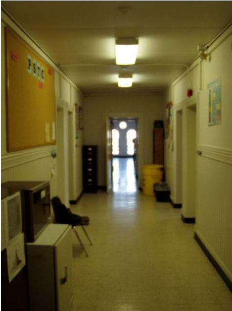
FIGURE 9. College dorm as offices before.