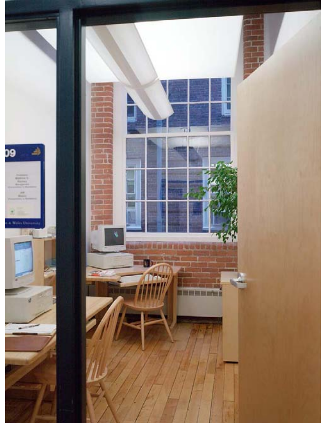
FIGURE 15. Office with acoustic cloud.

intrinsically very “green.” Linoleum, for example, is a natural replacement now for its own prior “improved” replacement, vinyl composition tile. This older flooring is new again, made of post-industrial sawdust and linseed oil but reinforced with recycled glass fiber backing as tile in wonderful colors. Improvements on older materials also abound without sacrificing aesthetics. Carpets would have been wool (and can be again on a large enough budget), but recycled and recyclable nylon and polypropylene also serve well. Millwork once done in mahogany can now be replicated in low-VOC, non-formaldehyde MDF. Slate sills and thresholds can become recycled-content solid acrylic, and wallpaper can be used that is both rapidly renewable, flame-retardant, and breathable to help those historic walls (Fig. 14).