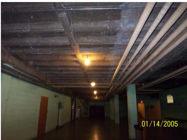
FIGURE 7. Church basement before.