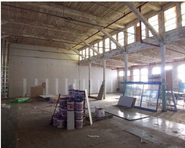
FIGURE 11. Mill building monitor before.