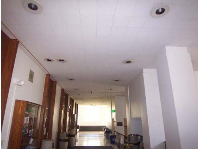
FIGURE 5. 1910 lobby with 1960 remodel.