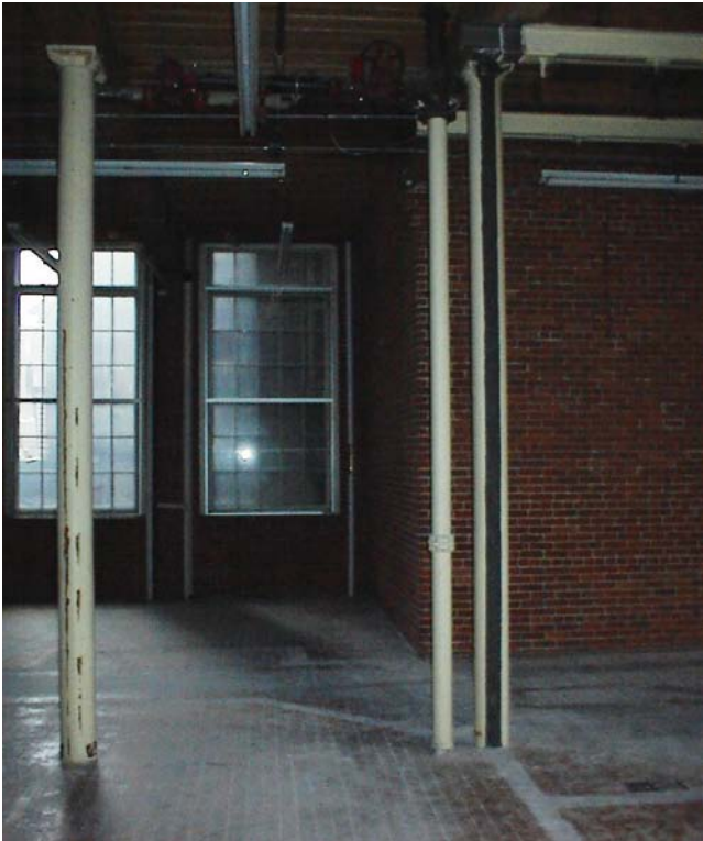
FIGURE 2. Downtown factory before.